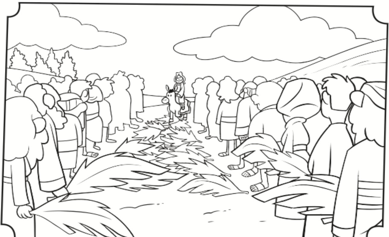
Jesus rode into Jerusalem on a donkey and the people cried "Hosanna!" and waved palm branches. John 12:12-15